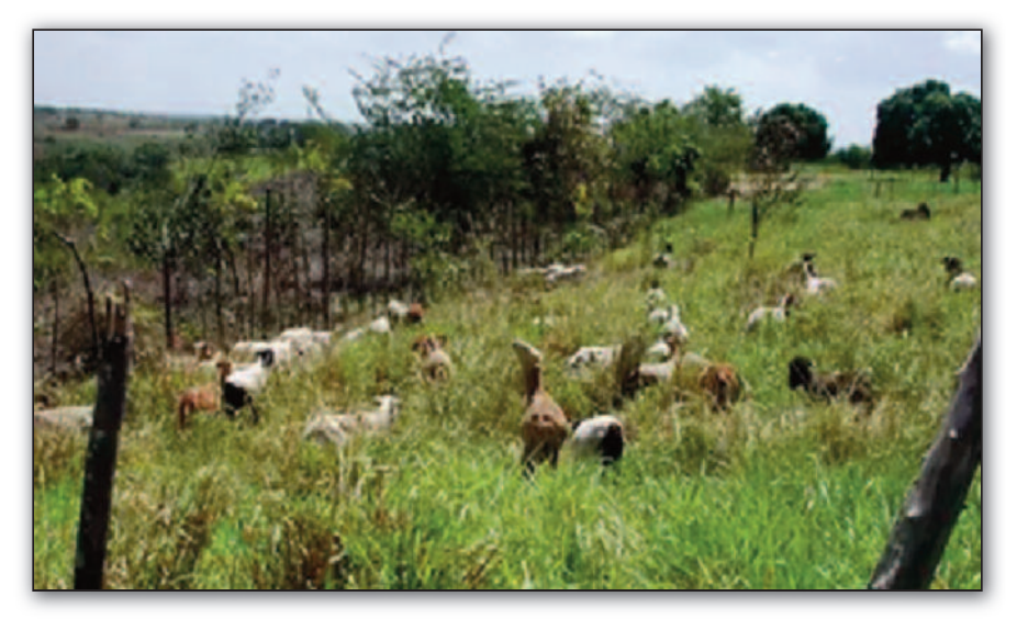
Typical sheep and goat grazing in DR

Sub-tropical places like the Dominican Republic traditionally keep 'Hair Sheep' – breeds like the Dorper, Katahdin, Blackbelly or Pelibuey that don't on the whole need shearing and are also tough and adaptable breeds to thrive on open ranges with little human intervention.