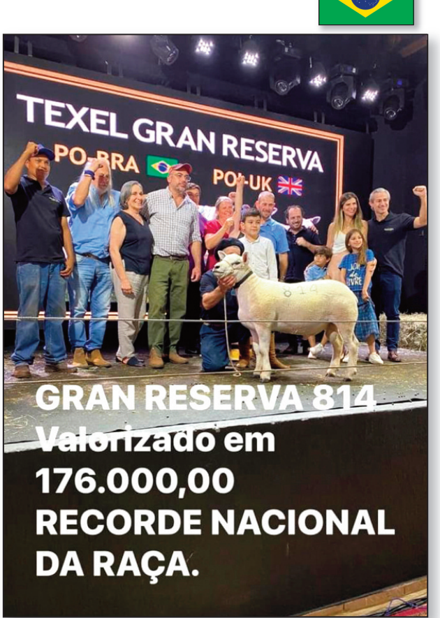
British genetics were prominent throughout the sale

British genetics were in demand throughout the sale which resulted in a new Brazilian record average of more than £3000. •