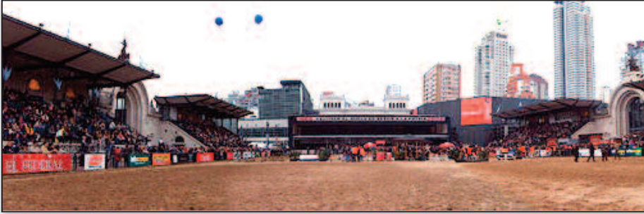
View of the main ring at Palermo's 'La Rural' show