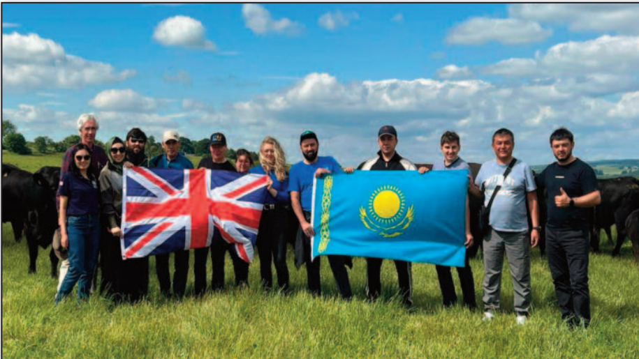
Kazakh delegates pictured at Netherton