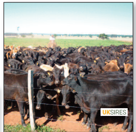
Made in Britain

Having been offered the opportunity to bid for the facilities at Dartington, the tender was won in 2001 and UK Sire Services was born thanks to widespread industry support and individual investment.