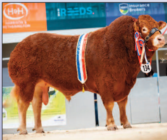
Clockwise from the top: