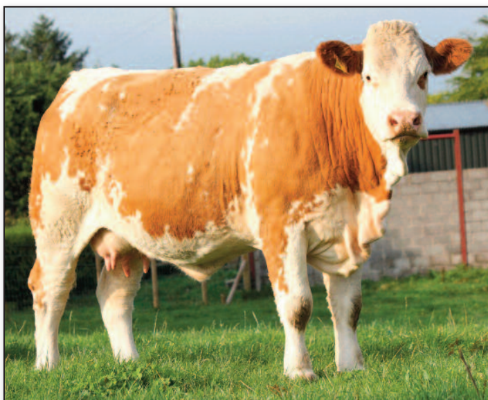
Sales from the Slievenagh, Omorga and Hiltonstown herds Slievenagh Klassy Lady and Omorga Moses (right)

January saw the export of two cows and calves, five heifers, and one young bull to breeders in Switzerland and Germany – a real coup and recognition of British genetics and breed improvement exporting back to the breed's homeland.