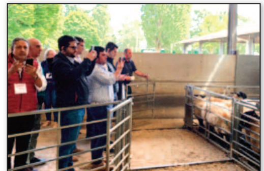
Group at Rugby Market

Friday saw everyone come together at AHDB for a final 'wash-up' meeting to see what had been learned and what we could do to facilitate sales going forward. UKECP and UKTAG would like to thank all those involved in making this a very interesting and varied visit from which trade in semen and embryos will follow. ●