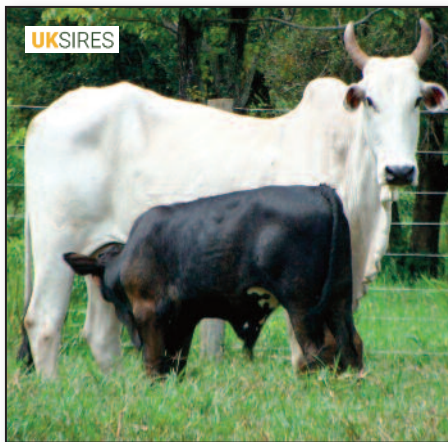
British Angus F1 calf on Nelore dam

Exports remain core to the whole business with overseas clients who understand, respect and demand only the best British genetics. The last 21 years has seen sales from 38 different breeds to 50+ countries. These vary in volume from the extremes from Brazil (Angus) and Rwanda (Jersey Island) to tiny Atlantic islands like St Helena and Tristan da Cunha using semen from various British breeds to maintain their sustainable breeding programmes. ●