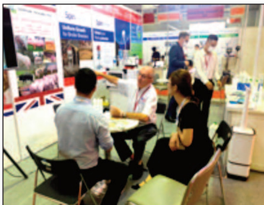
Explaining the UK pig offering

The first livestock Expo held in SE Asia since Covid, ILDEX proved vibrant with both buyers and exhibitors excited at being able to talk again directly person-to-person. With over 350 exhibitors from 30 different countries, the event attracted an audience of more than 12,000 visitors over the three days.