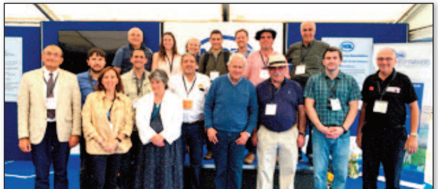
Group pictured at the Sheep Event