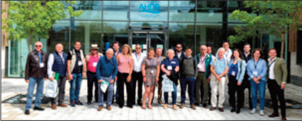
LATAM group at AHDB headquarters

Visitors from Latin America (including Colombia, Chile, Uruguay, Paraguay, Brazil and Argentina) first met with industry representatives from AHDB and Embassy staff at the AHDB centre at Stoneleigh where they took in a number of seminars on the UK sheep industry, Signet, environmental advances and technical progress. This included a visit to Rugby Farmers Market showing the commercial side to lamb production.