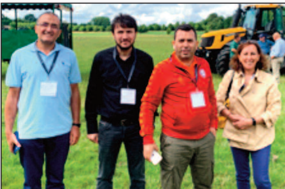
Turks at Daylesford Farm