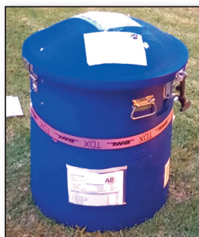
AB Europe semen flask