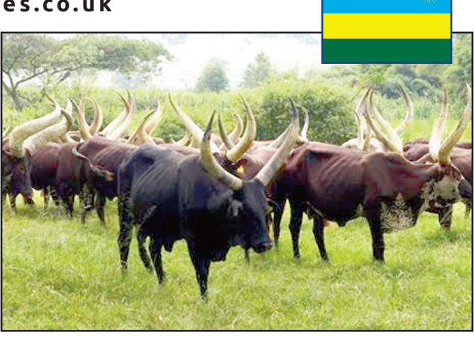
UKS Ankole cattle indigenous to Rwanda